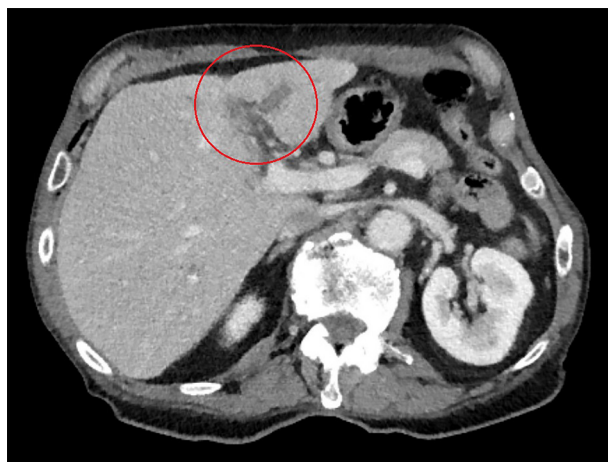
Figure 1. — Computed tomography disclosing a thrombosis in the left branch of the portal vein.

The CT image shows a thrombosis in the left branch of the portal vein. The EUS image discloses cholecystolithiasis without signs of choledocholithiasis. More important, a slim inner diameter (3.3 mm) of the common bile duct is seen, while the wall is thickened along its entire trajectory, in continuation with the cystic duct and gallbladder wall. This could be seen in IgG4-related sclerosing cholangitis (IgG4-SC). However no other arguments were in favor. In light with the recent