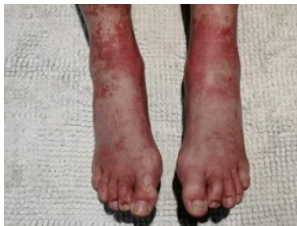
Figure 1. — Purpuric eruptions on the lower extremities suggestive for small-vessel vasculitis.

The patient had lost 17 kg (from 104 to 87 kg) in 16 months, initially thought to be due to increased daily activity. Despite this weight loss, the patient felt an abnormal and increasing fatigue, falling asleep every evening in front of the television. Other symptoms included loss of energy and cold intolerance. In addition, his stool consistency had changed somewhat, being softer and floating in the toilet, smelling more than before. Stool frequency however remained unaltered at three times daily. His appetite did not change either.